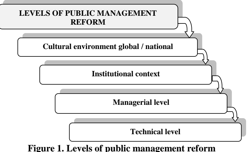
Figure 1. Levels of public management reform

The last decades of the 20<sup>th</sup> century and the beginning of the 21<sup>st</sup> century are characterized by the rapid growth of information and knowledge transfer speed and the rapid disappearance of many traditional barriers. The traditional model of supplying the public services, administrative planning and decision centralization, is replaced with public services management, based on the direct relationship with the market (Flynn, 1990; Androniceanu, 2005) The new public management is a reform model of the public sector, which refers to the managerial, organizational and structural changes. The four levels interact between them and a vertical hierarchy is not taken into consideration (Figure.1). The main levels where the most important reforms take place are the middle ones, the institutional and managerial level (Pollit, 2004).