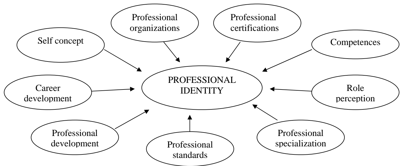
Figure 2. Factors involved in developing the concept of professional identity

Also in the context of our discussion, it is also important to refer to professional organizations (also called professional bodies, trade associations and professional societies), organizations that usually are non-profit and seek to support a particular profession, the interests of those involved in the profession and the public interest. These bodies generally strive to achieve a balance between these two terms, often contradictory.