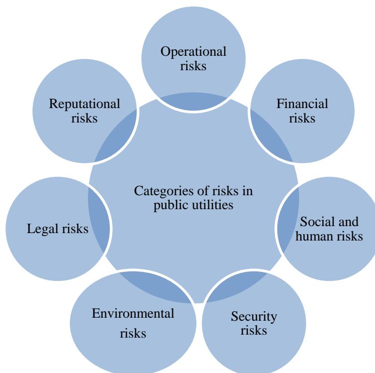
Figure 1. Categories of risks in public utilities

Regulatory (or legal) risk results from nature of regulatory norms and practices, with rules that determine the extent to which the interventions are discretionary and practices related to the interpretation that regulatory authorities gives to rules (Parker, 2003).