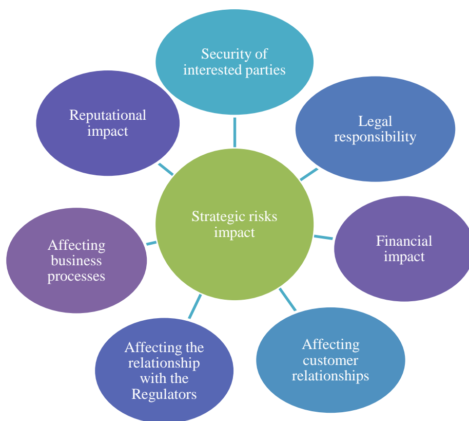
Figure 3. Strategic risks impact

By analyzing the impact that can be generated by the risks of water and sewerage services upon company's interests, we can find 7 major categories of effects, as presented in Figure 3.