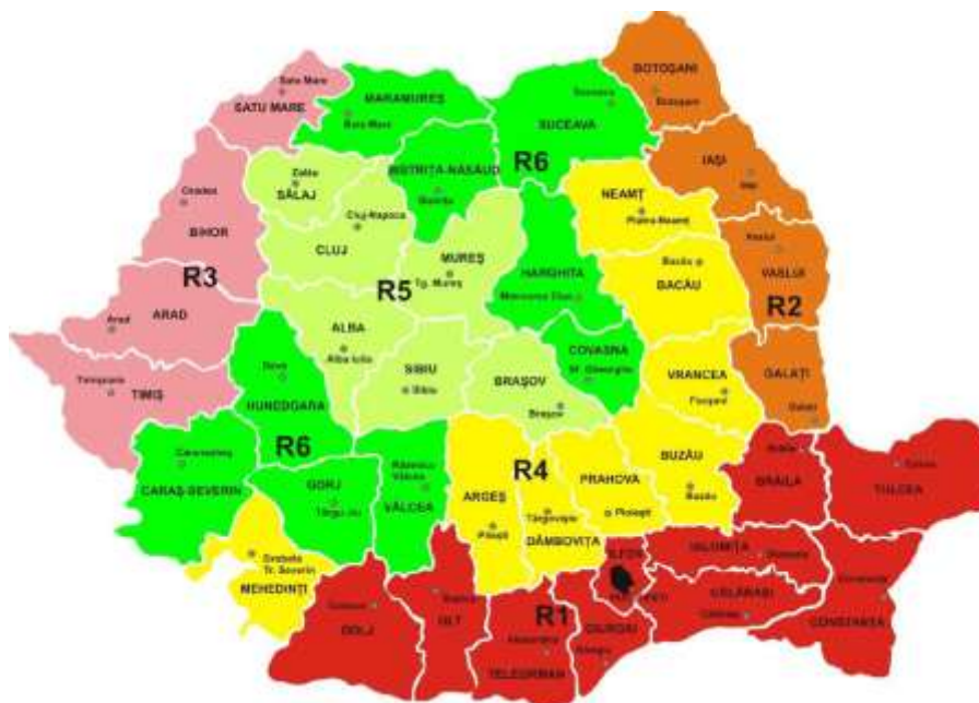
Figure 1. Percentage representation of permanent green cover in the ecological macroregions of Romania (R1=14.2%, R2=30.5%, R3=41.0%, R4=55.8%, R5=63.7%, R6=76.3%, Romania=47.9%)

Conversely, it is acknowledged that Romania has a substantial portion of its land (47.9%) covered with permanent greenery in ecological macroregions (Otiman, 2014, p.96). This characteristic establishes favorable foundational conditions for extensive agro-food development (Figure 1).